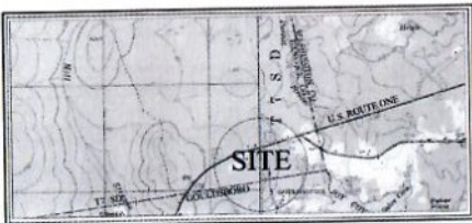
SITE DIAGRAM 1'-2000"

LAND NOW OR FORMERLY OF THE STATE OF MAINE BY PATENT OF JOHN B. DAY DATED JANUARY 11, 1824